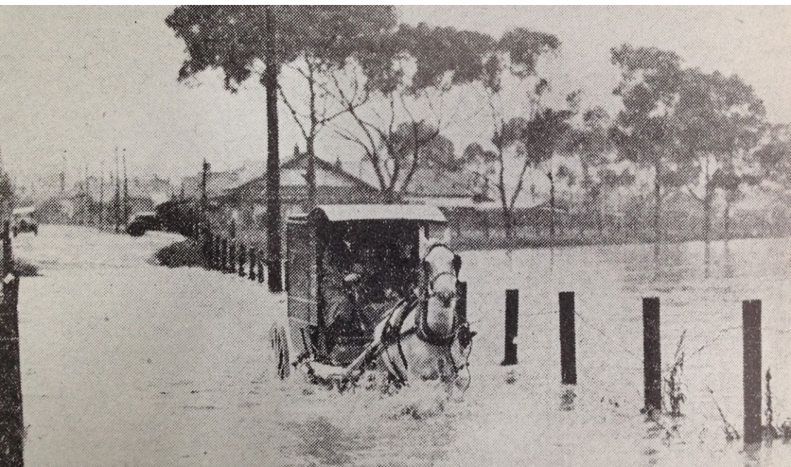
Ford at Wave Street, 8 December 1930, from The Development of the Elster Creek Drainage System, Melbourne Metropolitan Board of Works.