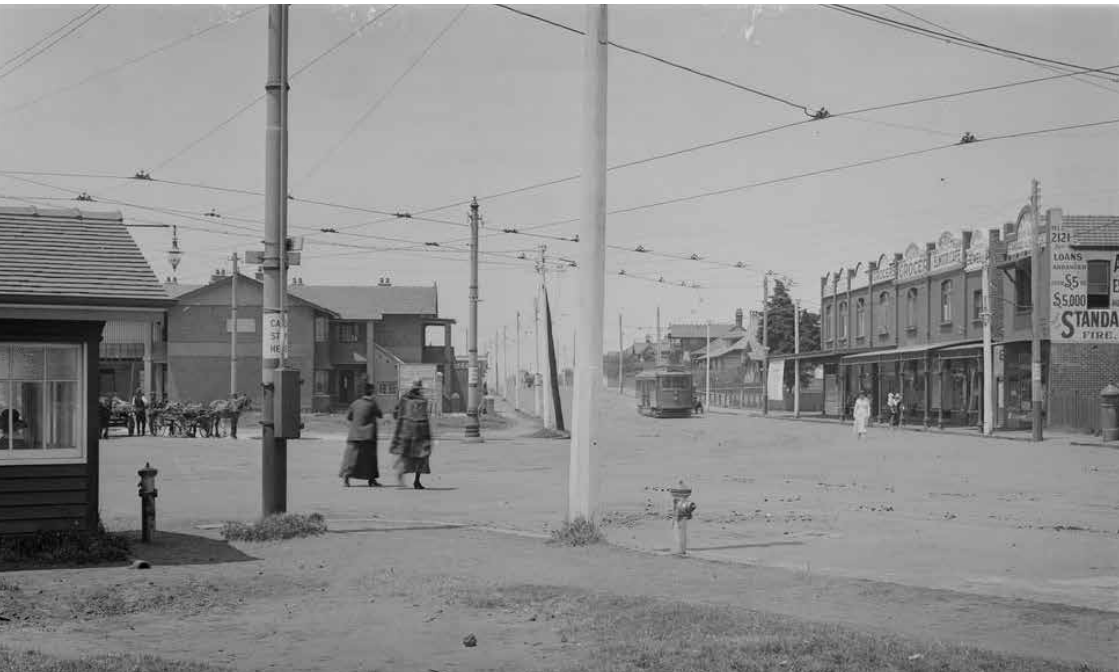
Broadway, Elwood. The Rose Series P.3406. Courtesy State Library of Victoria H32492/4711.

At the end of Head Street is the outfall platform (33) which sits above a huge diversion drain running from New Street. Constructed in the 1950s to mitigate flooding in response to a petition of more than 3,000 signatures to State Parliament, the drain channels stormwater away from Elwood and out to sea.