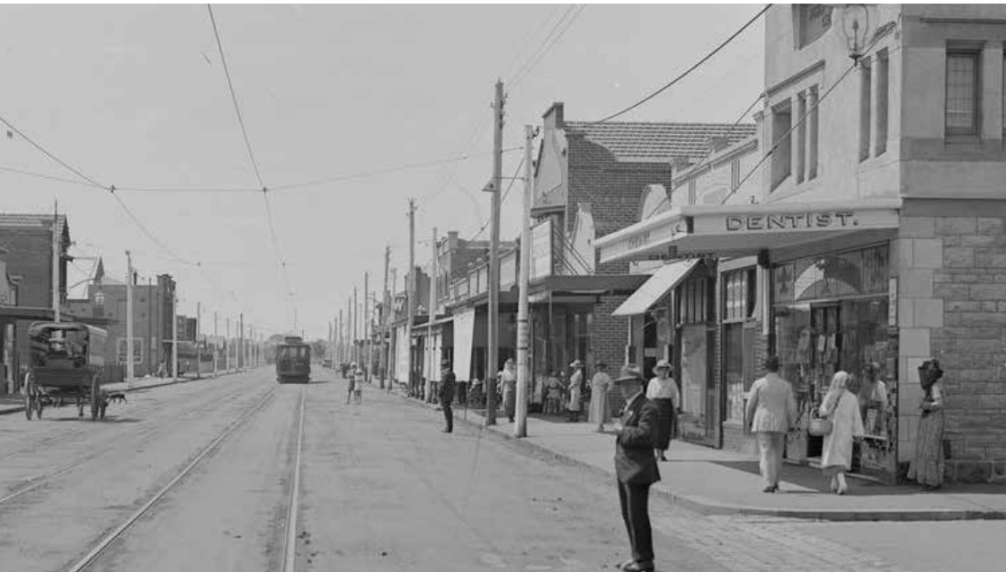
Ormond Road, Elwood, Victoria. The Rose Series P.3405. Corner of Vautier Street.